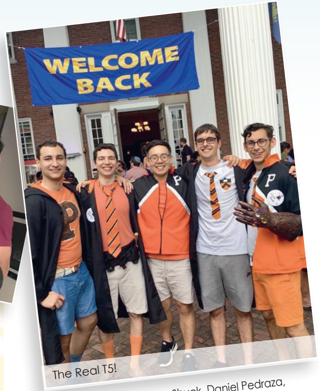
The Real T5!