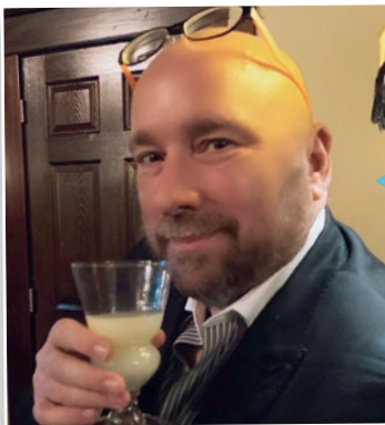
Taken in Naples Florida recently. Come visit!