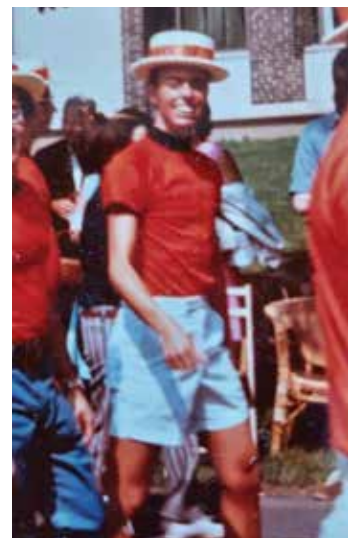
► Graduation P-Rade 1972