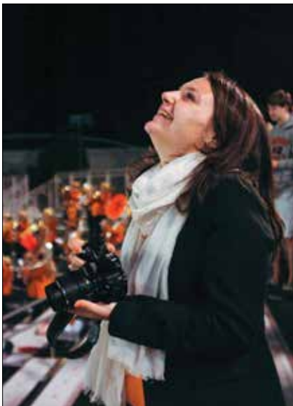
► Taking photographs at a Princeton football game

I love photography because it allows us to pause a moment in time and see things from a different perspective. At Princeton, I was the photography editor of The Daily Princetonian , and I loved capturing sports and events