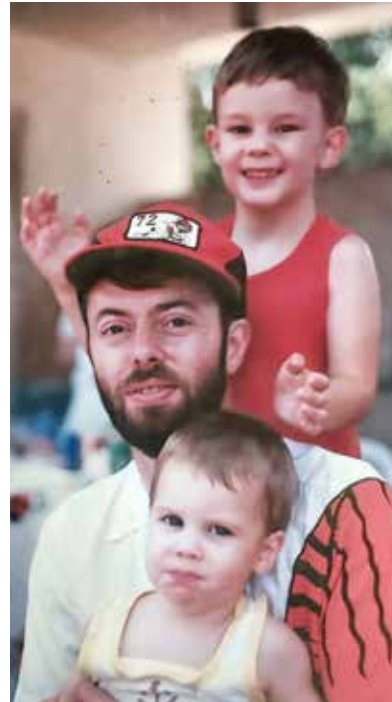
► Reunions 1988