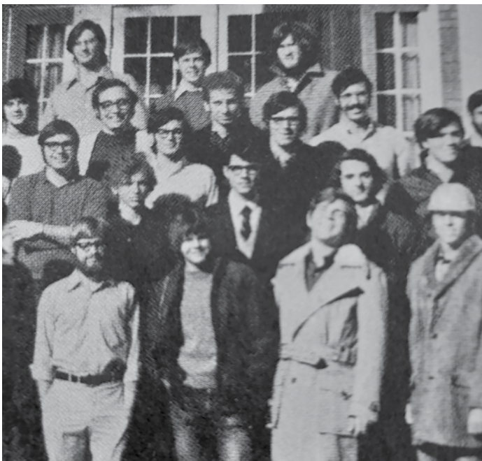
► Colonial Section Picture 1972-73