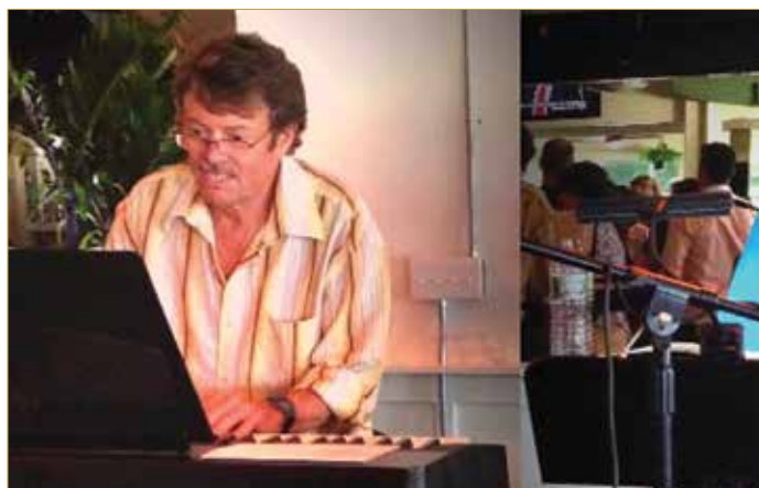
► Entertaining at a Benefit