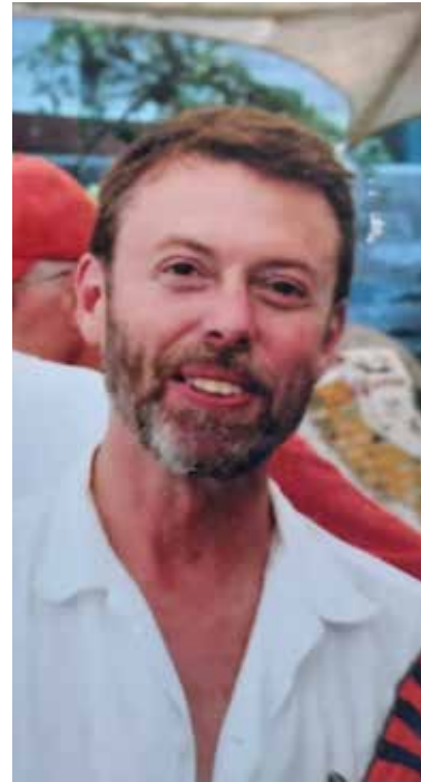
► Reunions at Colonial