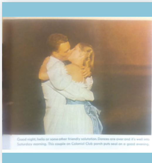
Good night, hello or some other friendly salutation. Dances are over and it's well into Saturday morning. This couple on Colonial Club porch puts seal on a good evening.

One of those places, apparently, was Colonial Club. As part of a spread about Princeton, the magazine printed the image (right) in October 1950, captured outside Colonial Club on a Friday night.