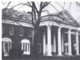
RED AND BROWN: Colonial Club members are considering building a dormitory on our property in the next few years.

... that in 1974 members voted to build a Spelman-like dorm out the back for members to live in?