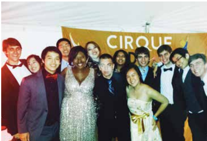
2014-15 Officer Corps