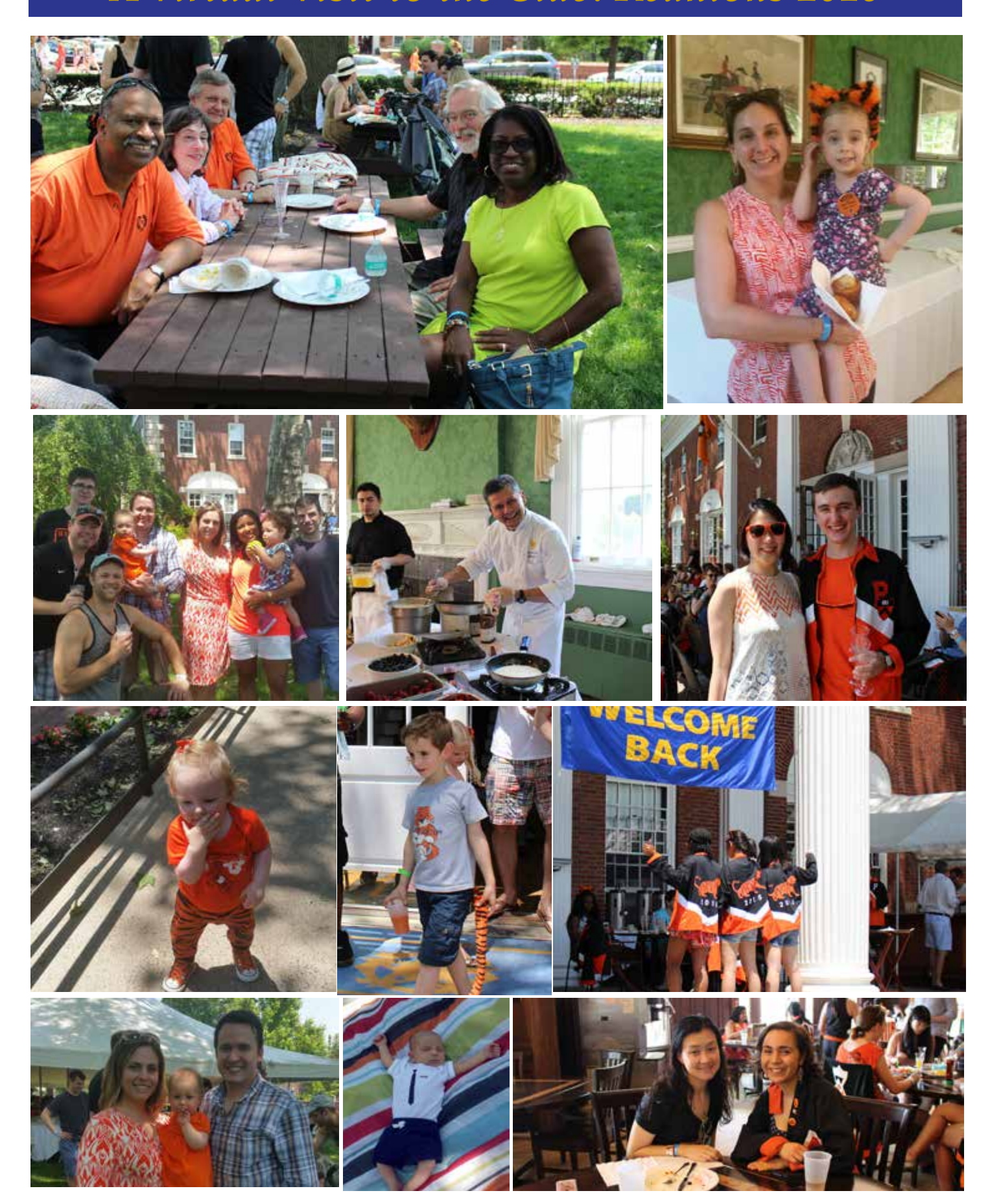
Bound together by genuine ties of friendship