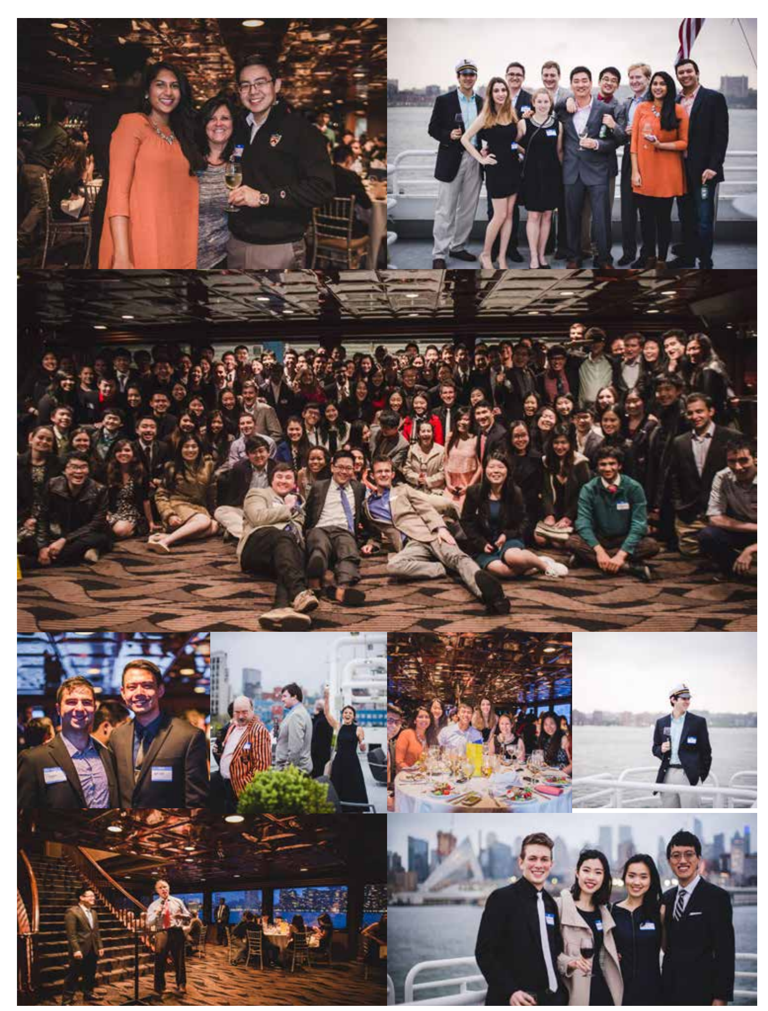
Bound together by genuine ties of friendship