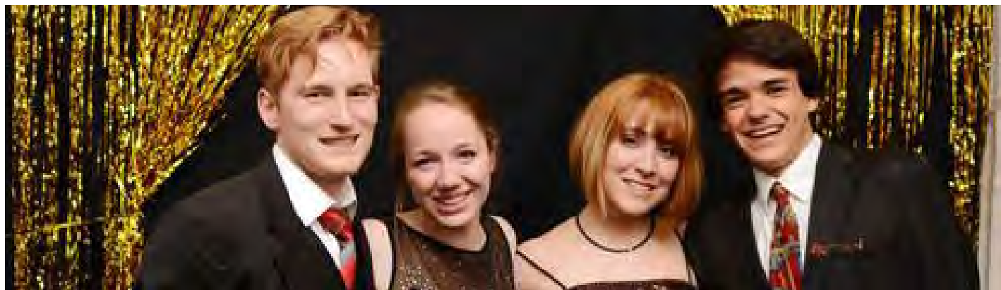
Bound together by genuine ties of friendship

Keep us updated on your life and we may post it in the next newsletter! Send your life news and celebrations to manager@colonialclub.com .